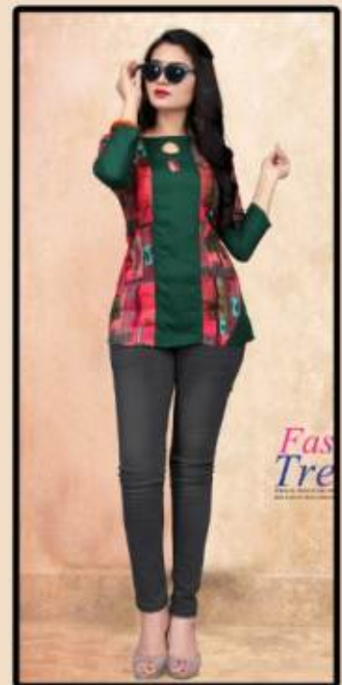
STYLE -NO. 2710