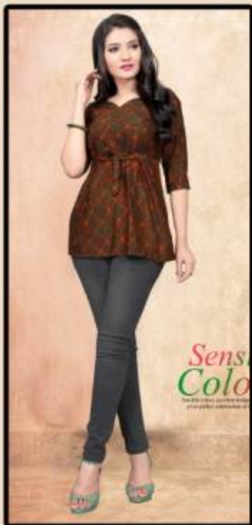
STYLE -NO. 2704