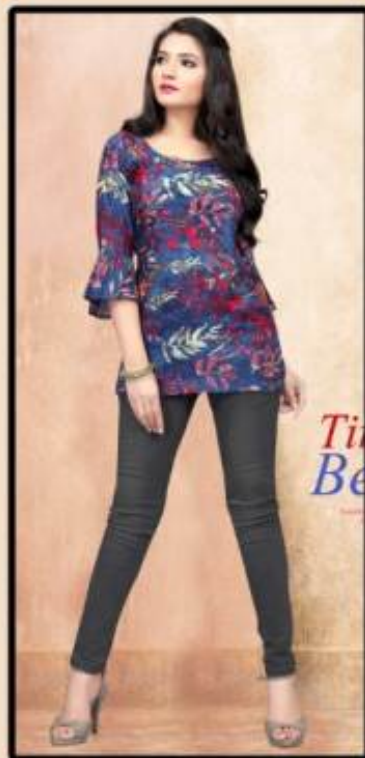
STYLE -NO. 2705