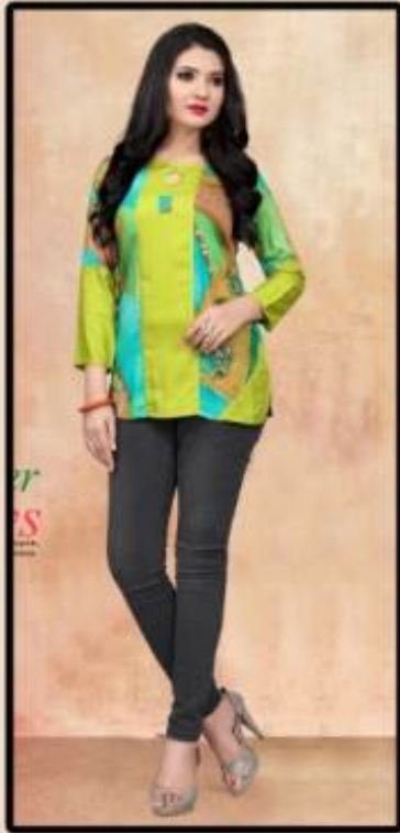
STYLE -NO. 2707