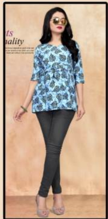
STYLE -NO. 2706