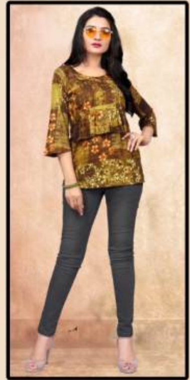
STYLE -NO. 2709