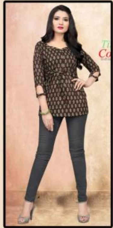
STYLE -NO. 2703