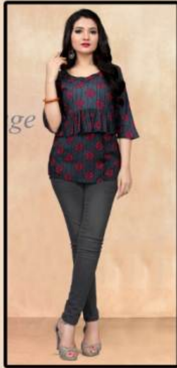
STYLE -NO. 2708