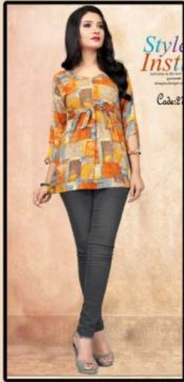
STYLE -NO. 2702