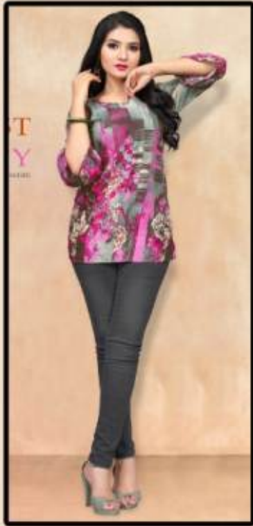
STYLE -NO. 2701