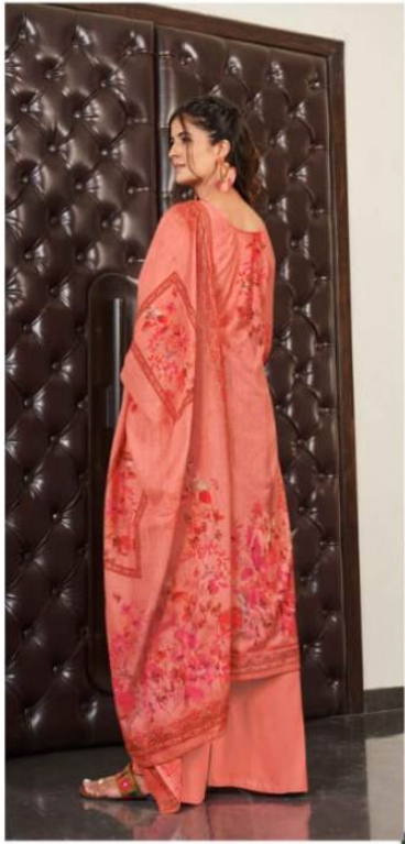
POWERFUL PRINTS & PATTERNS A FASHION TREND FOR THE SUMMER SEASON. 1571