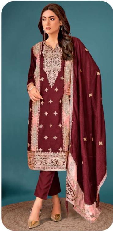
D.No 239 A