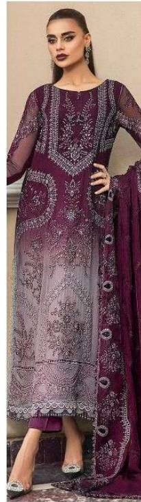
D.NO.164 - B