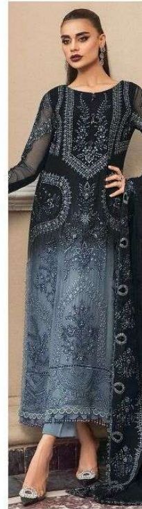
D.NO.164 - C