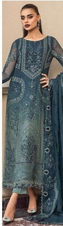
D.NO.164 - A