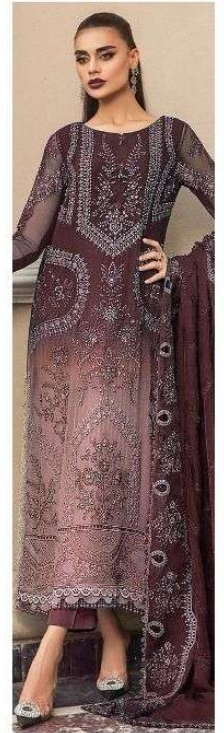
D.NO.164 - D