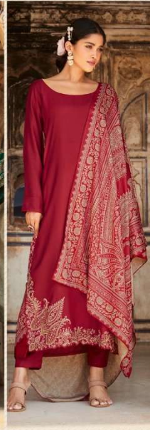
◻ 1005 ◻