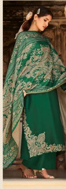
◻ 1004 ◻