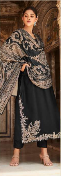
◻ 1001 ◻