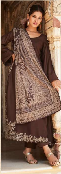
◻ 1003 ◻