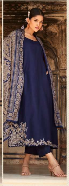
◻ 1006 ◻