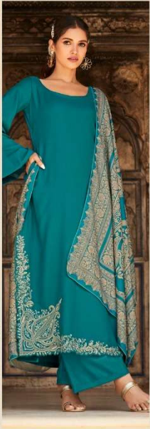
◻ 1002 ◻