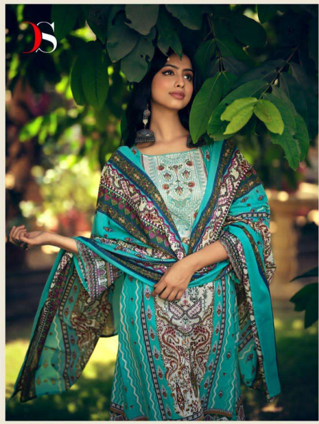
Contemporary geometric patterns