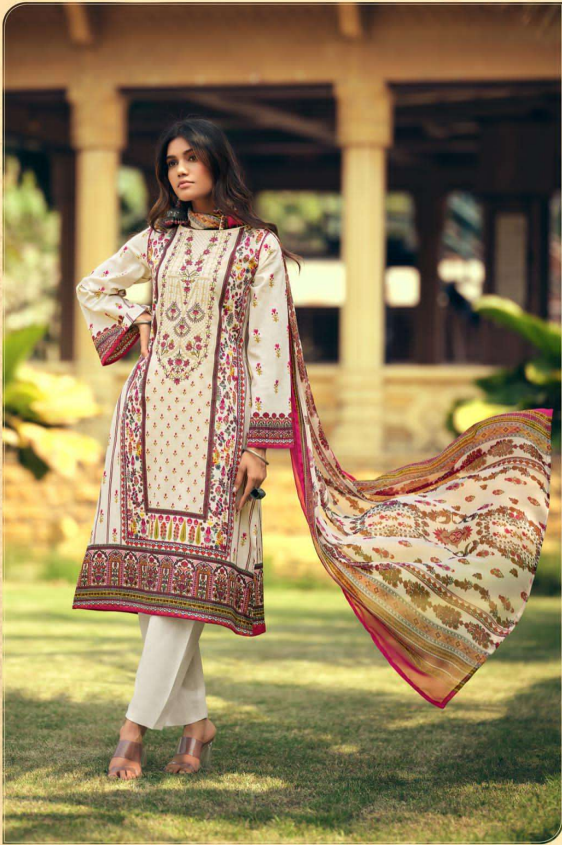
Modern asymmetry captivates