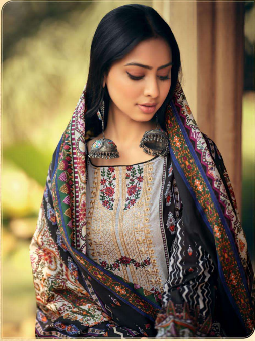
Casual summer sundress style