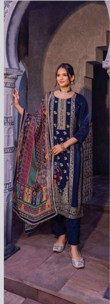
DASTOOR 3623 Volume 5