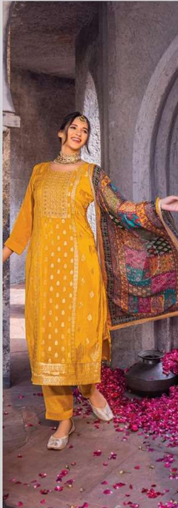
DASTOOR 3624 Volume 7