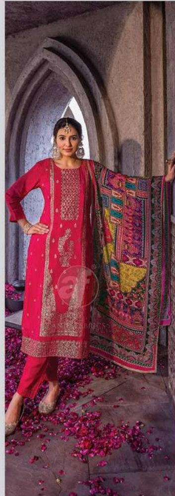
DASTOOR 3625 Volume 7