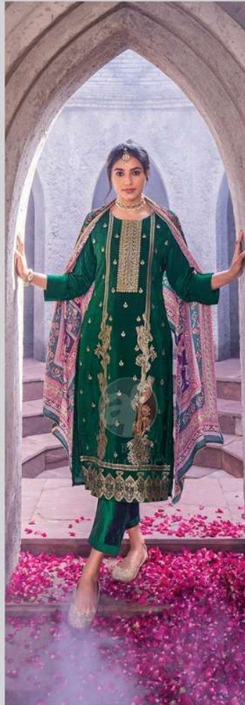
DASTOOR 3622 Volume 5