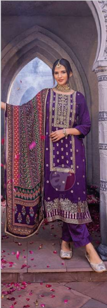
DASTOOR 3621 Volume 5