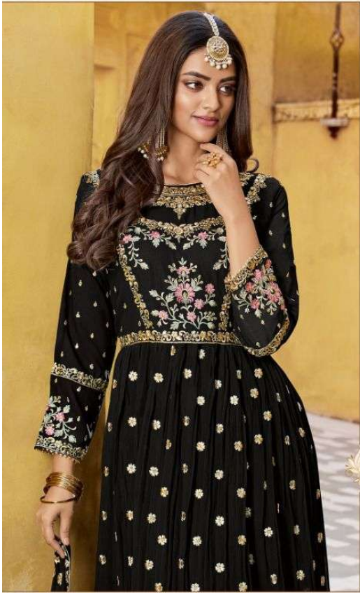
1001 | THE BEST LOOK ANYTIME ANYWHERE