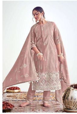
LOOK | 8926