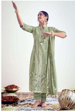
LOOK | 8921