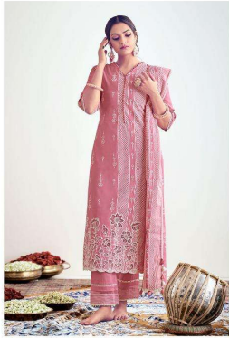
LOOK | 8923