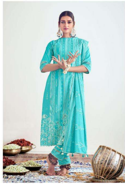
LOOK | 8922