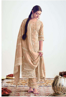
LOOK | 8924