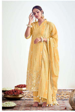
LOOK | 8925