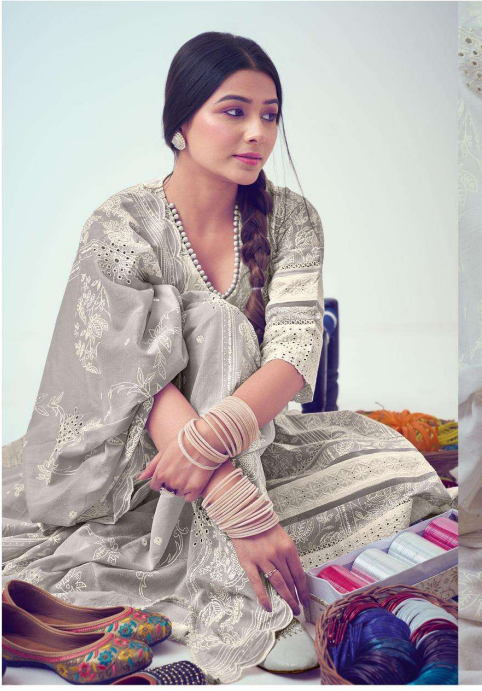
THE NEW AGE STYLE CALLS FOR A CHANGE IN TREND. DITCH HEAVY EMBROIDERY FOR SPECTACULAR PRINTS ON THE LIGHTER-THAN-AIR DRESS