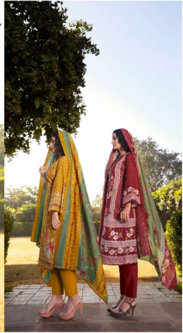
Remains a mystery