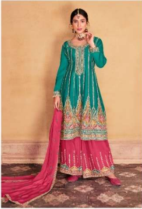
CODE | 2053