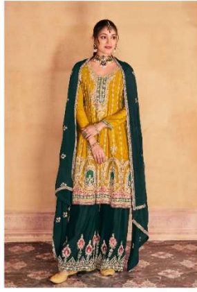
CODE | 2052