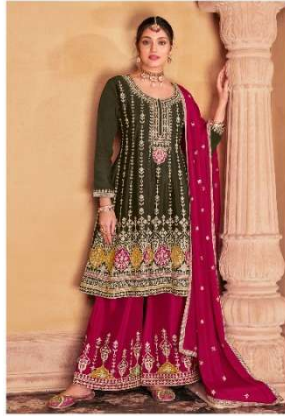
CODE | 2054