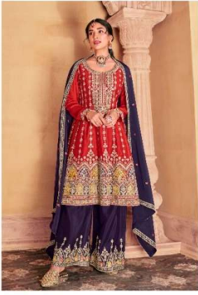
CODE | 2051