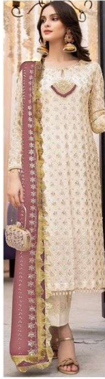
D.NO.170 - A