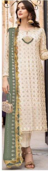
D.NO.170 - F