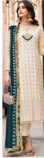
D.NO.170 - D