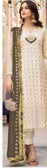
D.NO.170 - E