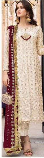
D.NO.170 - C