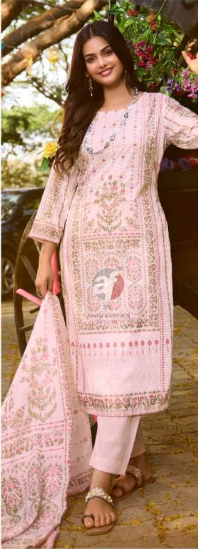
D.no.3724 Flairs VOL-3