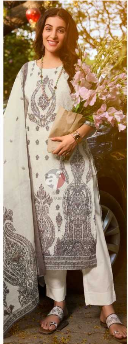
D.no.3723 Flairs VOL-3