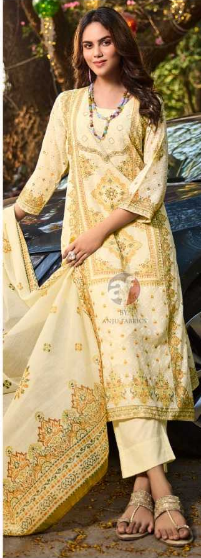
D.no.3725 Flairs VOL-3