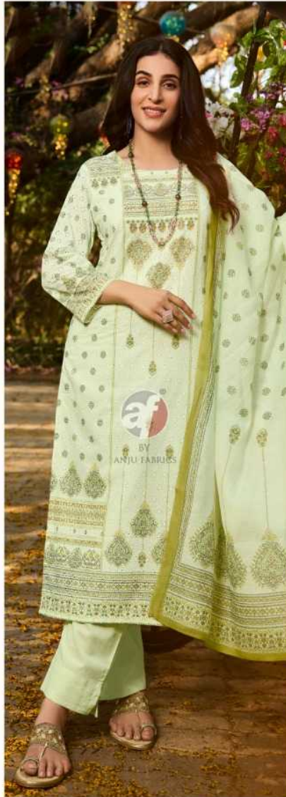
D.no.37522 Flairs VOL-3