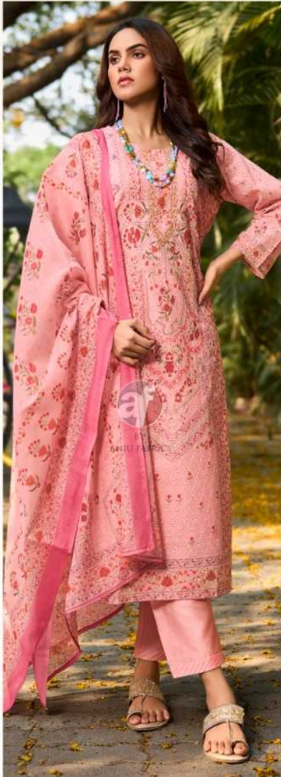
D.no.3721 Flairs VOL-3